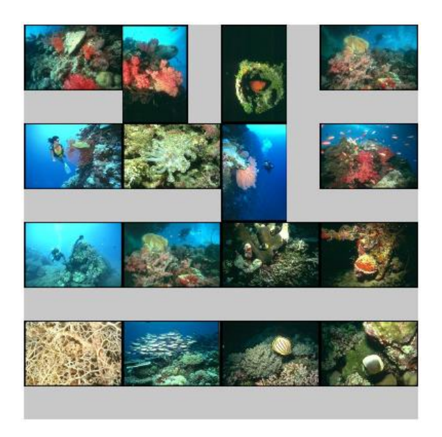
Figure 2. Some of the images from an ocean theme cluster found by clustering on text only. This cluster contains most the images in the two clusters in Figure 4, but the red corals are mixed in with the other more general ocean pictures.