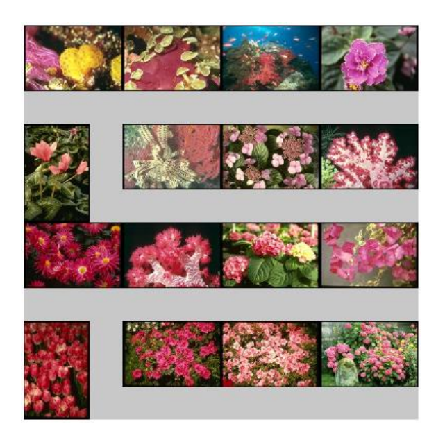
Figure 3 An example of a cluster found using image features alone. Here the coral images are found among visually similar flower images. Clearly some semantics are lost, although the grouping across semantic categories is interesting.