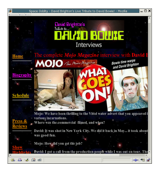
Figure 4 . Original web page from which second David Bowie image sourced.

With an eye on supporting collaging at runtime within the digital library, an additional routine was added to the