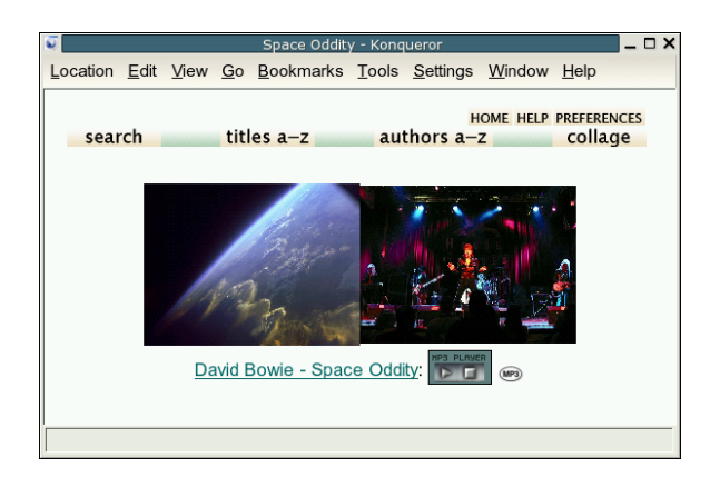
Figure 3. Viewing the work: two images, title and the audio playing

to the format through a linking mechanism); 2) a set of parsers called plugins that process document and metadata formats; 3) a set of modules called classifiers that are used to build browsing structures; and 4) a scheme for designing individual digital library collections by providing a configuration file that specifies what kind of documents and metadata they are to contain, and what searching and browsing facilities they provide.