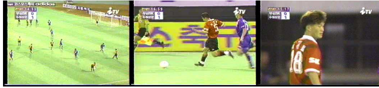
Fig. 1. Dominant color ratio as an effective feature in distinguishing three kinds of views in soccer video. Left to right: global, zoom-in, close-up. Global view has the largest grass area, zoom-in has less, and close-ups has hardly any (including cutaways and other shots irrelevant to the game)