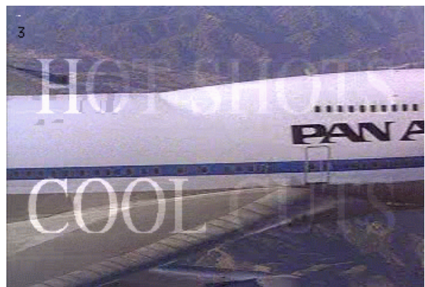
(b) Smaller Quantizer 20% higher BitRate