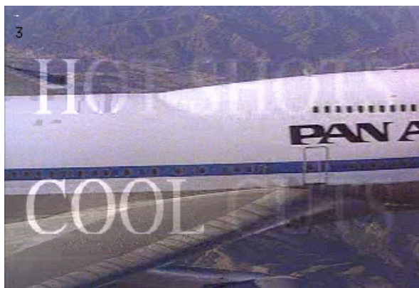
(a) Original BitRate