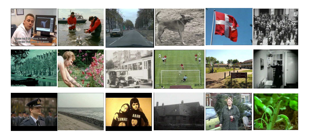
Figure 3. Example images from TRECVID 2007 data set. Most images in this data set are multi-labelled. For example, the first image of the first row is labelled as: "office, face, person, TV screen";the first image of the second row is labelled as: "outdoor, building, vegetation, road, sky"; the first image of the third row is labelled as: "face, person, crowd, police, military".

would like to further investigate whether multiple codebooks would be helpful for SPM in the future work.