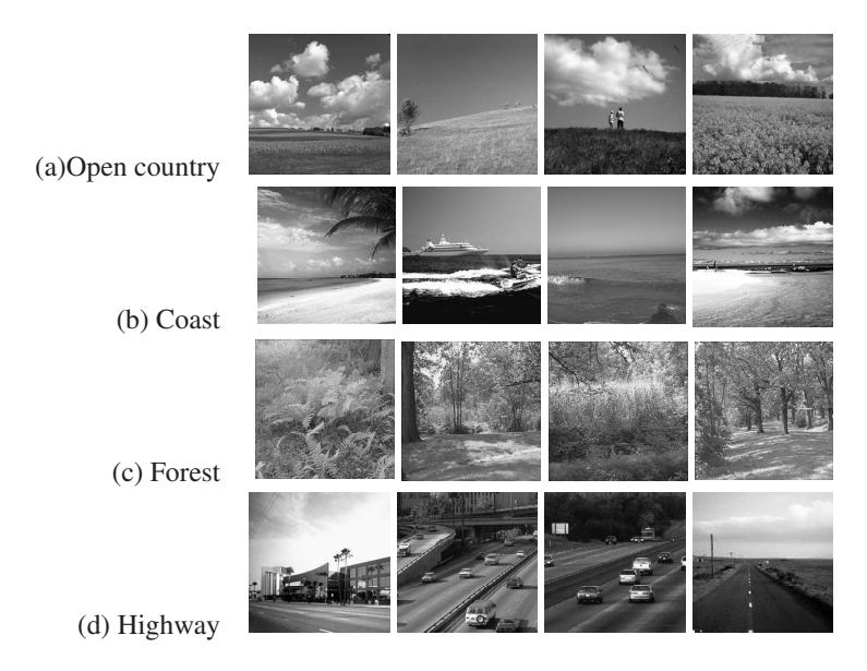
Figure 1. Examples of pictures in the natural scene dataset